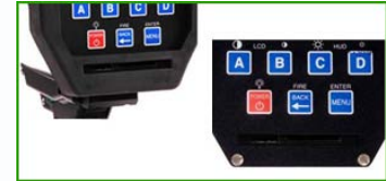
SD Memory Card Slot/USB Port

Allows for wireless data transfer between laser and mobile computers, cameras and other mobile devices.