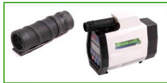
8x Monocular Scope

Attaches in front of the head-up display and provides standard video-out connector for connection to a recording device.