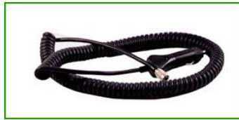
12VDC Coil Cord

Charges two battery handles in two hours and stops when battery is fully charged to protect battery life - use in office or vehicle.