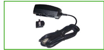
AC Wall Charger w/ Cord

In-car battery charging cord, can be used to extend charge while system is in use.