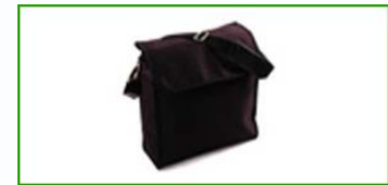
Softside Carry Case

Fitted case for Advantage™ or Profiler™ systems with pocket in lid for documents and accessories.