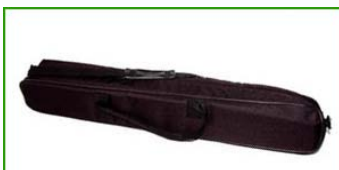
Tripod Softside Carrying Case

Nylon case with shoulder strap, includes four accessory pockets and velcro closure.