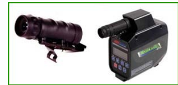
8x Monocular Scope

User-installable, hinge-mounted scope to easily switch between magnified and regular head-up display views. For SpeedLaser® R.