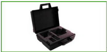
Standard Hard Shell Case