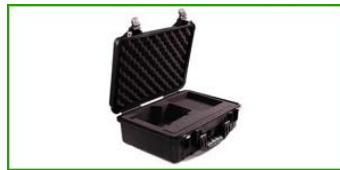
Heavy Duty Hard Case

Cushion fit for protection in transport used with SpeedLaser® systems.