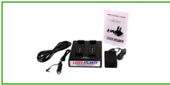
Smart Charging Battery Station™