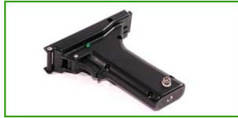
Premium Battery Handle

Wall plug 9V charger charges 2 batteries simultaneously. For use with 9V Battery Handle (5H90). 2 high density 9V rechargeable batteries included with charger