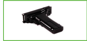
Economy Battery Handle

System battery handle provides connection for tripod mounting.