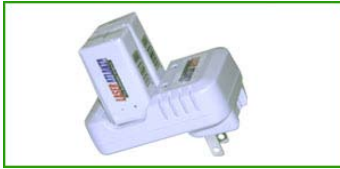
9V Wall Battery Charger

Universal input 100 volts to 240 volts (50 to 60 Hz) wall plug. Charges Laser Atlanta rechargeable (5HT0) battery handles