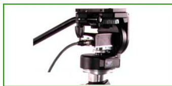
Horizontal Encoding Tripod

Three telescoping legs each in three sections. 360 degree rotating swivel head.