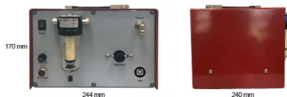
Rugged, compact design